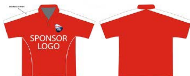
Example of umpiring shirts/uniform

Umpiring shirts/uniforms: The sponsor's name and/or logo may be displayed on the umpiring shirts/uniforms that are worn on the field of play. The shirts should also display the Event logo.