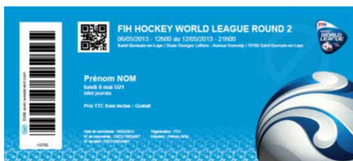
Example of a ticket design

Ticketing: The sponsors names and/or logos may be displayed on the tickets.