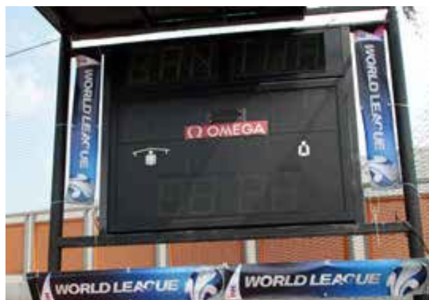
Example of a scoreboard with Event and sponsor branding

Scoreboard: The sponsors names and/or logos may be displayed on the information board.