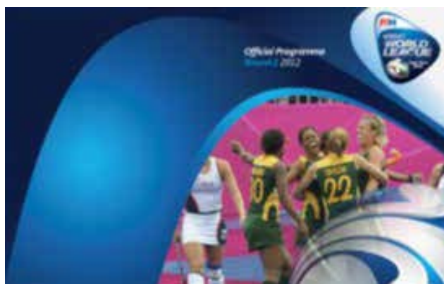
Example of a program book cover

Event literature and printed materials: The sponsors names and/or logos may be included on print and promotional items, e.g. the Event poster, flyers, stationery (letterhead, envelopes, business cards etc.), tickets, accreditations, invitations, event advertisements (newspaper/radio/TV), website and social media, press conference and/or interview backdrops, results boards, press releases etc.