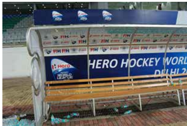
Example of a team bench with event and sponsor branding

Team benches and Technical Table: The sponsors names and/or logos may be displayed on the team benches (on the roof top, outside back wall, inside back wall above the bench or similar).