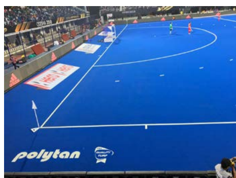
Example of perimeter board

Perimeter boards or banners around the Field of Play: The sponsors may have the right to place an agreed number of perimeter boards or banners (preferably solid boards) around the Field of Play. Boards and banners can be first tier (i.e. ground-level) and/or higher up (e.g. on the fences behind the goals).