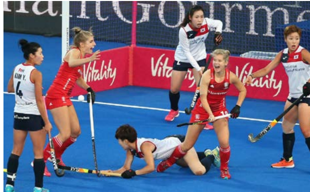
Example of goal side and back boards

Goal boards: The sponsors names and/or logos may be printed on the inside and/or outside of goal boards. The design must ensure that the goal boards are not predominantly of a light colour (e.g. the background must not be white or another light colour).