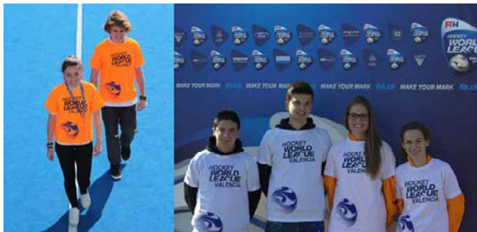
Example of ball patrol shirts/uniform and volunteer shirts/uniforms

A maximum of two (2) sponsor names and/or logos can be displayed on the abovementioned shirts/uniforms (one on the front and one on the back) unless agreed otherwise with the PAHF/FIH.