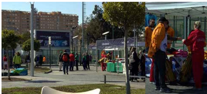
Example of display/sales stand

Display/sales stand: The sponsors may have the right to set up and operate a display/sales stand during the event, e.g. a stand selling hockey equipment, promoting a car brand etc.